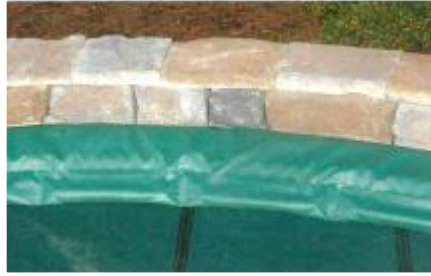
CUSTOM SIZES AVAILABLE