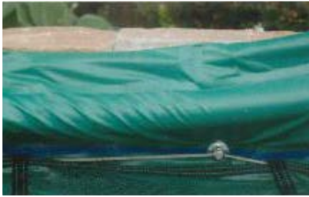
ANCHOR & CABLE SYSTEM