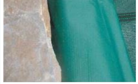
ELIMINATES ALL GAPS